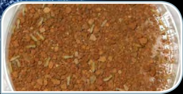
ULTRATHOR Soil Contact Study

The performance of the active constituent in ULTRATHOR has been proven around the world, in all types of conditions, and in the most difficult-to-control situations. Under Australian conditions, results have been outstanding. These results have also been confirmed in extensive laboratory studies where we can more directly observe the behaviour of the termites.