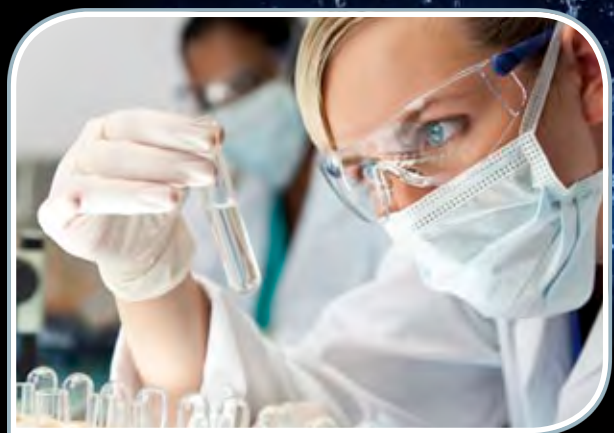
ULTRATHOR has been rigorously assessed by the independent APVMA

ULTRATHOR is water-based, odourless and will not leach through soil. It is not damaging to soil micro-organisms, earthworms or plants.